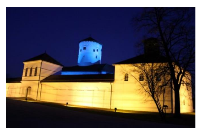
Budatín Castle in Žilina in colours of Ukraine on 17th March as a mark of solidarity