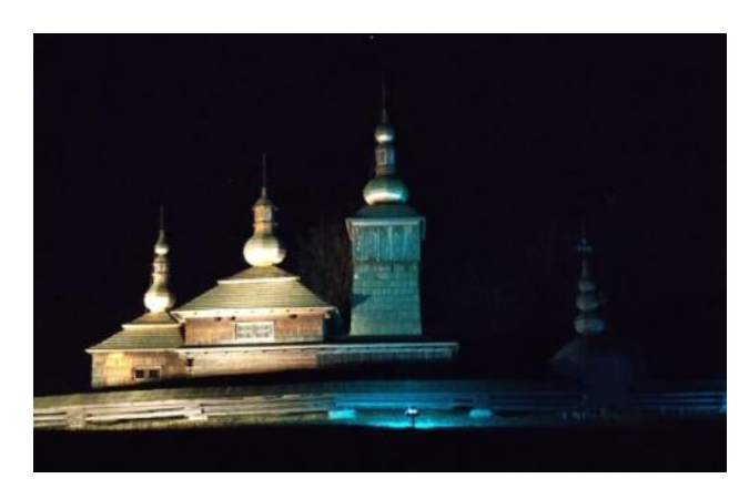
Slovak National Museum of Ukrainian culture lit in colours of Ukraine on 17th March as a mark of solidarity