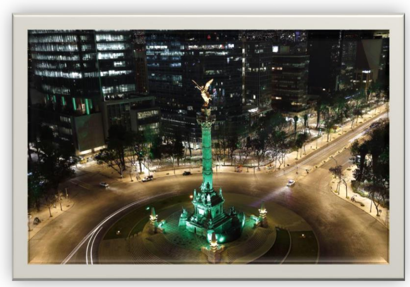
Global Greening Mexico. Ángel de la Independencia