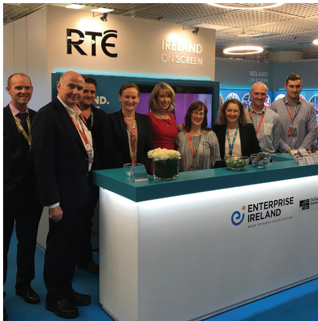
Promoting Ireland's creative industry at the MIPCOM Television Trade Fair, Cannes, 16th October 2018