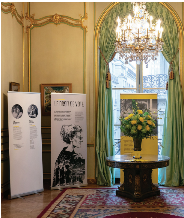
Blazing A Trail exhibition, Embassy of Ireland, Paris 7th March 2019

The Embassy in Paris already has strong and growing links with France's regions and cities as well as a network of Honorary Consuls in Lyon, Cannes and Cherbourg. But recent reforms have given greater powers to the French regions and feedback from the Irish community indicates a strong desire for greater regional engagement.