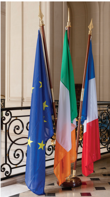
EU, Irish and French flags at the Embassy of Ireland, Paris

As we mark the 50 th anniversary of President de Gaulle's visit and Ireland strives to double its global impact, it is timely to look again at our relationship with France and to explore what more we can do together in spirit and in action.