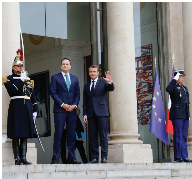
The Taoiseach Leo Varadkar meeting President Emmanuel Macron in Paris, April 2019