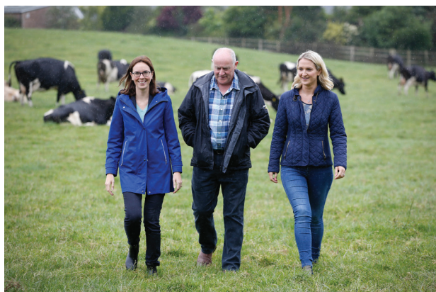
Minister of State for European Affairs Helen McEntee and her French counterpart, Amélie de Montchalin, visit a family farm in Ireland, July 2019

There are over 400 Irish companies active in the French market and over 23,000 people are engaged in Irish-owned companies in France. The Franco-Irish business network, NetworkIrlande , has 90 members and supports links between businesses working closely with the France Ireland Chamber of Commerce.