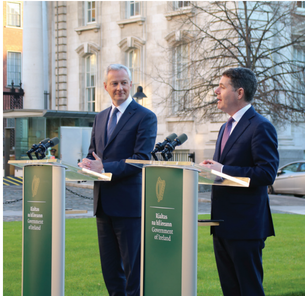
The Minister for Finance Paschal Donohoe and his French counterpart, Bruno Le Maire, in Dublin, February 2019