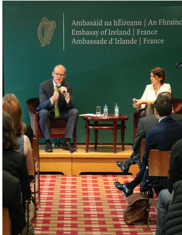
The Tánaiste Simon Coveney speaking on 'Brexit, Ireland and Europe' at 27, in Paris on 15 March 2019