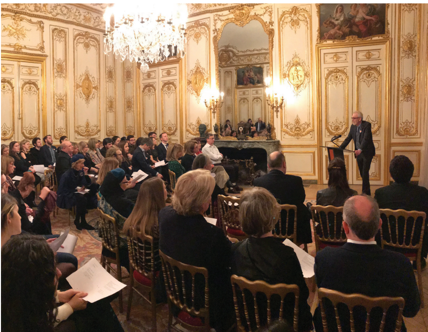
Seachtain na Gaeilge event at the Embassy of Ireland, Paris, 1st March 2018

We will expand our Honorary Consul network.