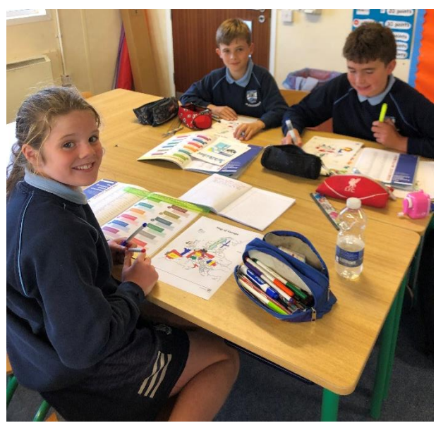
Pupils from Rush National School using their Blue Star Programme resources to learn about European History.

The broad scope of the Blue Star Programme meant that pupils were able to focus on a historical theme appropriate to their age and class. In this way, the Programme afforded teachers the necessary flexibility to adapt it to suit their requirements and curriculum. Pupils completed the 'Historical Flement Quiz' which is part of a wider method of completion to the Blue Star Programme. introduced in 2021.