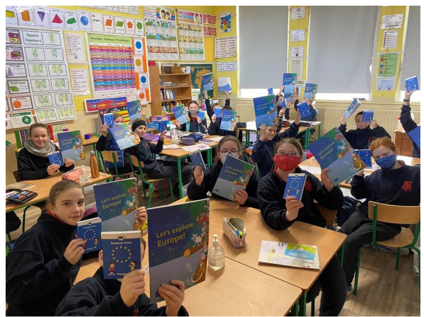
Shanahoe NS with their 'Let's Explore Europe' one of the Blue Star Programme teaching resources.

The Blue Star Programme also issued Media Consent Forms when schools registered, to allow for permission to share photos or videos of the pupils and their work. EM Ireland is committed to practices which protect children from harm. We also recognise that good child protection policies and procedures are of benefit to everyone involved in the Blue Star Programme.