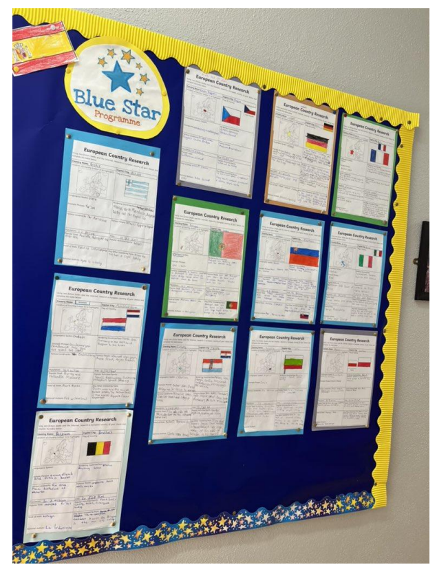
European Country Fact Files from pupil from St Colman's NS.