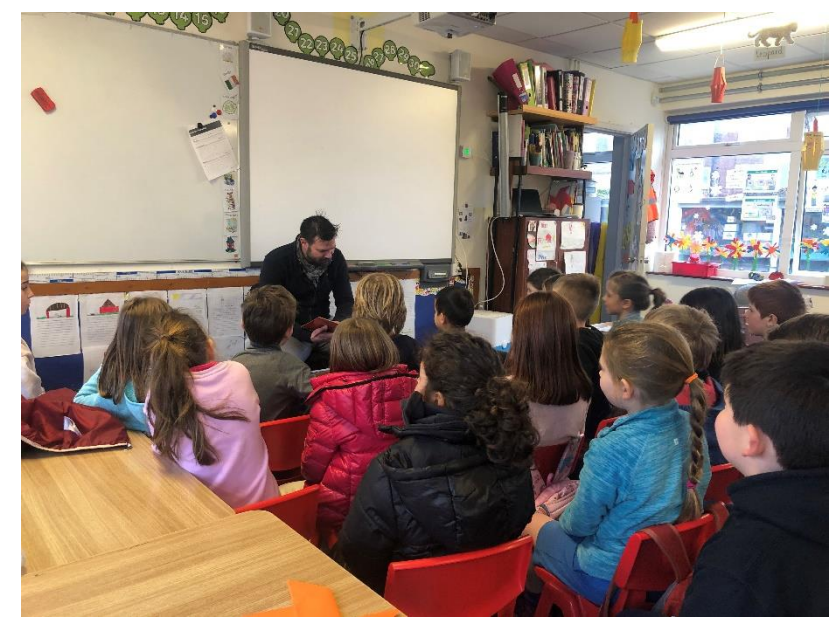
French Restaurateur reading a book in French to pupils in Kildare Place School.

This year, EM Ireland continued to encourage schools to broaden the scope of potential VIP visits to include student teachers from other EU countries through the eTwinning programme, as well as the involvement of past pupils and parents whose work is related to Europe. In the future, EM Ireland would encourage schools to also explore the potential for such visits to facilitate foreign language learning through presentations from native speakers from other EU countries.