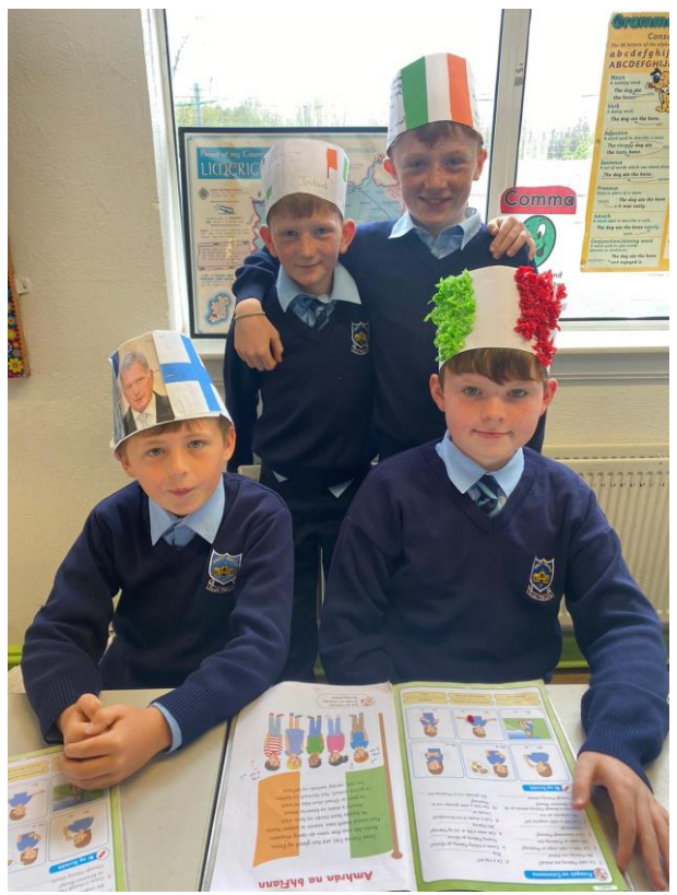
Pupils at St Mary's BNS celebrating Europe Day/.

On 9 May 2022 we encouraged teachers to mark Europe Day and schools did this by holding events such as the 'Handshake for Europe'. The traditional 'Handshake for Europe' symbolises the solidarity among European citizens and celebrates the diversity of a strong and inclusive Union. Schools also held a variety of other events, such as 'Dress-Up Days' where pupils were asked to dress up in European-themed outfits.