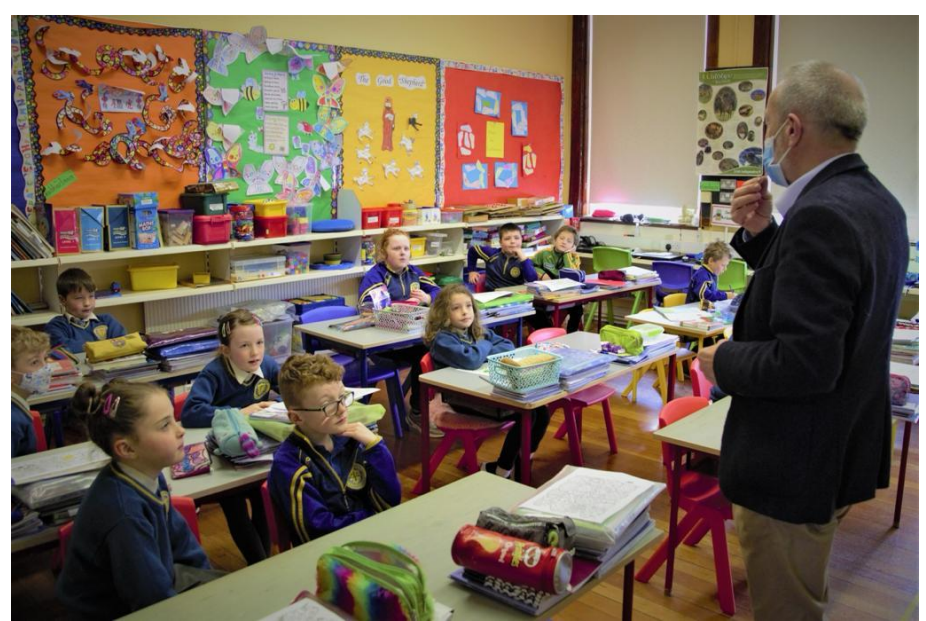
Seán Kelly MEP visiting Loughfouder N.S., in person VIP Visit.

Blue Star Programme schools were asked to submit a form when a visit, whether virtual, in-person, or through the Pen-Pal system, took place.