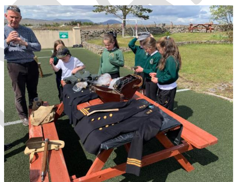
Pupils from Scoil na Maighdine Muire gan Smál Co. Galway received a visit from a local historian who showed them some impressive World War II memorabilia.

The broad scope of the Blue Star Programme meant that pupils were able to focus on a historical theme appropriate to their age and class. In this way, the Programme afforded teachers the necessary flexibility to adapt it to suit their requirements and curriculum. Additionally, due to school closures this year, the availability of Blue Star Programme resources online allowed pupils to continue working on their projects while they were schooling from home. Many teachers mentioned that the availability of these resources online afforded them the opportunity to complete the Programme this year as it was possible for pupils to continue their work at home when it was needed. Finally, pupils completed the 'Historical Element Quiz' which was a new initiative introduced by the Blue Star Programme Team for the 2020-2021 school year.