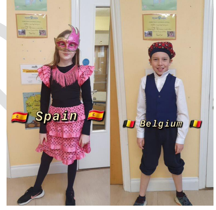
Pupils at Lurga N.S., dressing up in traditional clothes from stated countries as part of their Europe Week celebrations.