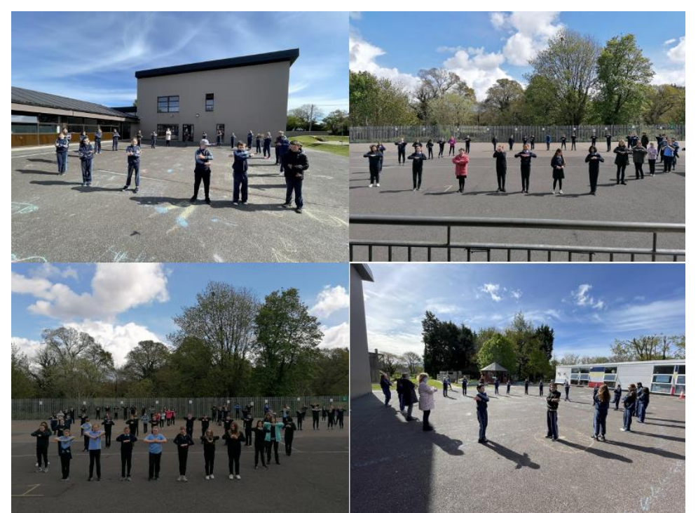
Pupils from various primary schools across Ireland taking part in the 'Air Handshake' in their school yards in solidarity and unity with each other.