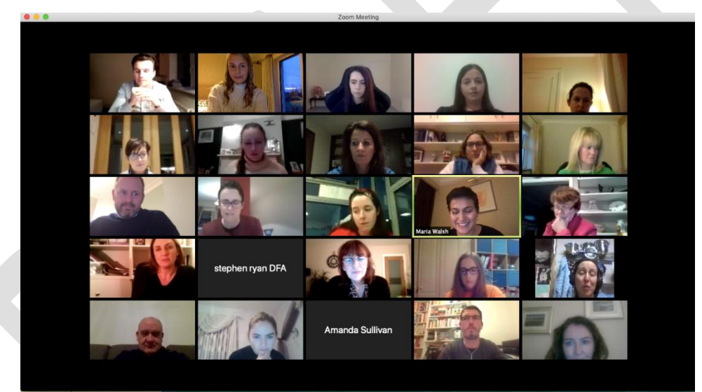
Teachers taking part in the interactive teacher training workshops held in both November and January.