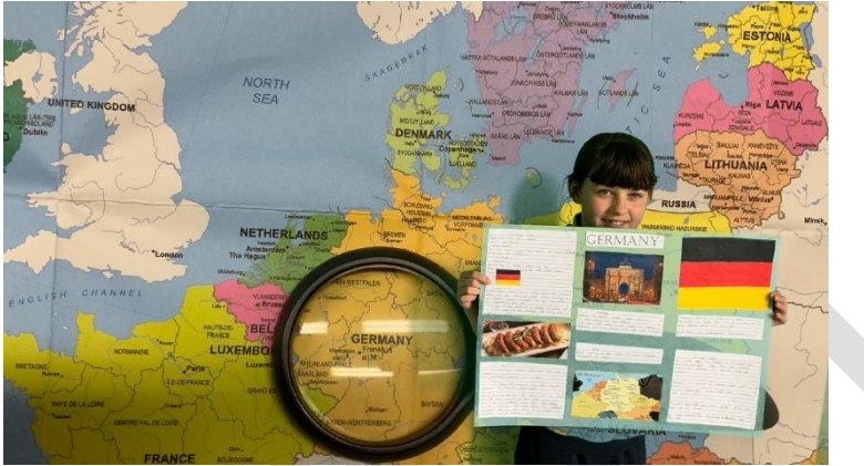
Pupil from Cloughfin N.S., Co. Donegal with her Geography project on Germany.

For this module, some schools also used interactive maps and technology to learn about the capital cities of European countries; we were pleased to see this continued integration of technological teaching resources to aid pupils' learning. Additionally, pupils completed the 'Geography Element Quiz'.