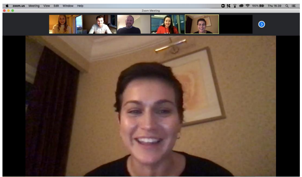
Maria Walsh MEP addressing teachers during the teacher training workshop on 26 November 2020.

Members of the Blue Star Programme Team gave a presentation to participating teachers during the teacher training workshops in November and January.