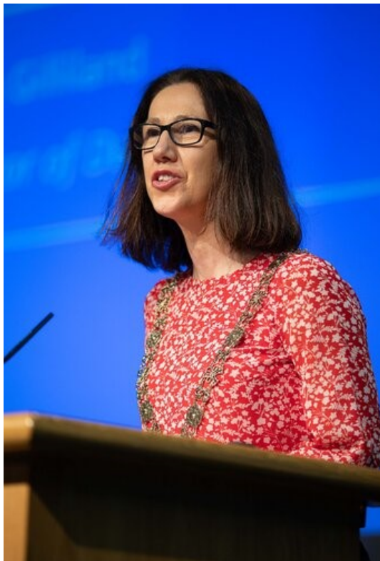
Lord Mayor of Dublin Councillor Alison Gilliland addresses the Citizens' Panel in Dublin Castle (left). Citizens attending the Panel in Dublin Castle (below) in February 2022

The Four European Citizens' Panels produced 178 recommendations on the future of Europe. The recommendations were subsequently discussed and debated in the Conference Plenary, with 80 of the Citizens' Panels members (20 per panel) being chosen as members of the Plenary.