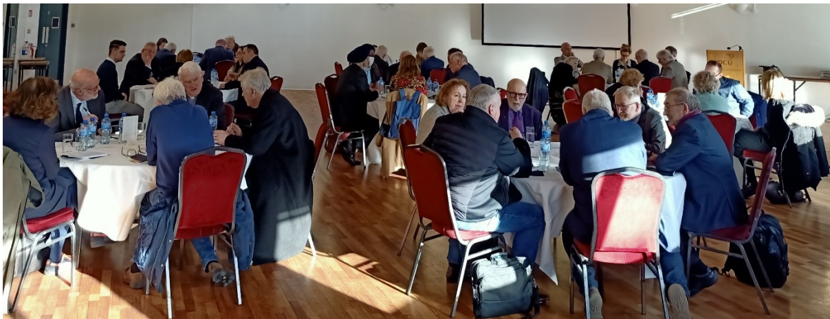
Participants take part in a Conference Event organised by the DCU Centre for Religion, Human values and International Relations (above) in February 2022.