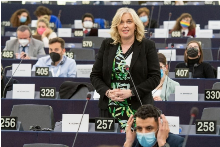
National Citizens' Representative Noelle O Connell takes part in a Conference Plenary Session in Strasbourg. (Left)