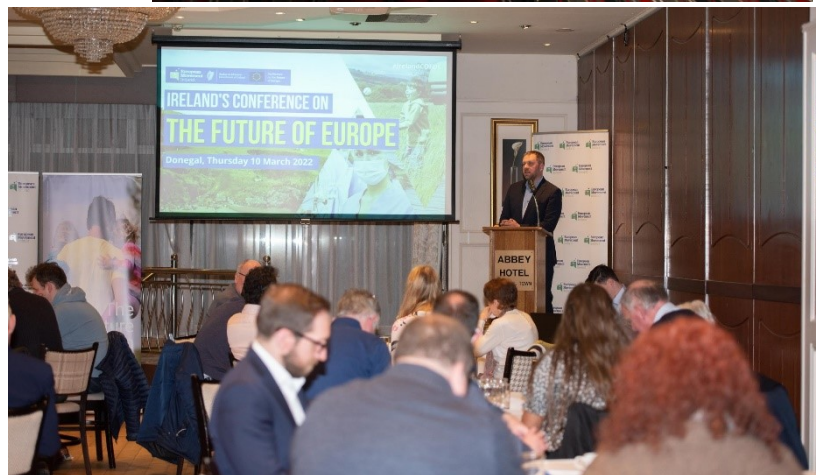
Participants in EMI Town hall events in Dublin, 31 March 2022 (Top) and Donegal, 10 March 2022 (bottom).