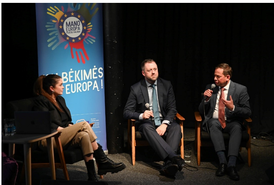
Minister of State for European Affairs, Thomas Byrne T.D. (centre) participates in a Conference event for young people in Vilnius, Lithuania, with Erica Jennings (left) and then Lithuanian Deputy Foreign Minister for European Affairs Arnoldas Pranckevičius in October 2021