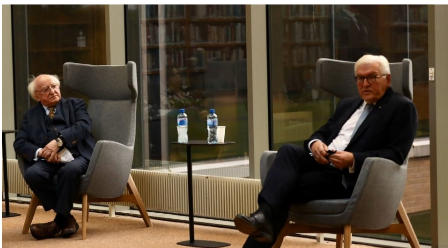
Uachtarán na hÉireann Michael D. Higgins (left) and German President Frank Walter Steinmeier (right) taking part in a Conference on the Future of Europe event in the University of Limerick, October 2021.