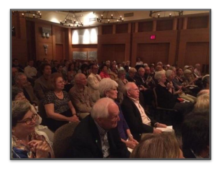
EMORY UNIVERSITY IN ATLANTA PACKED TO CAPACITY DURING YEATS EVENT.

The Consulate General in Atlanta organised an event at Emory University in Atlanta (left) which is home to one of the largest collections of Yeats papers and archives anywhere outside Ireland. The evening was full of attractions: poetry readings and discussions, academic speeches, music, theatre and photography exhibition. Local media also showed great interest: the Atlanta Journal-Constitution, Atlanta Business Chronicle and Global Atlanta all devoted column inches to the event and WABE (the local NPR franchise) ran an extended interview with two participants in the programme in the week preceding the birthday.