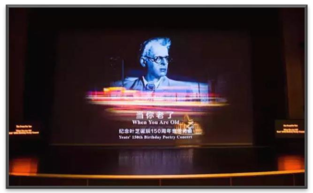
CONCERT IN TIANQIAO PERFORMING ARTS CENTRE, BEIJING

On 22 November, the Embassy in Beijing and A Poem for You jointly organised a poetry concert entitled When You Are Old which was held at the brand new Tianqiao Performing Arts Centre in Beijing (left). 1,000 people attended the concert and 50,000 people viewed coverage online. The spectacle included footage of Yeats receiving the Nobel Prize for Literature in Sweden, an audio recording of Yeats reading The Lake Isle of Innisfree , and readings in Chinese of The Lake Isle of Innisfree , The Wild Swans at Coole and