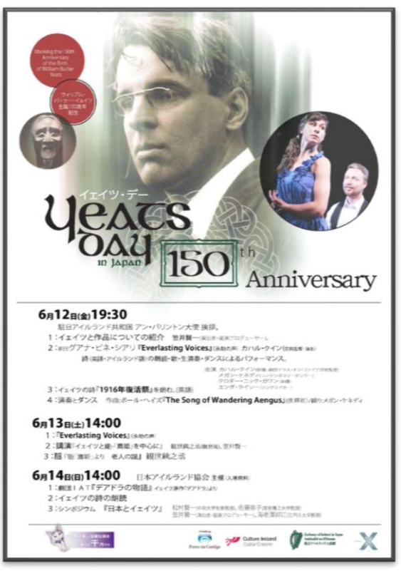
YEATS DAY POSTER, JAPAN.

The Department's travelling exhibition on Yeats was available in Japanese and featured at all anniversary events in 2015. To date, the exhibition has toured