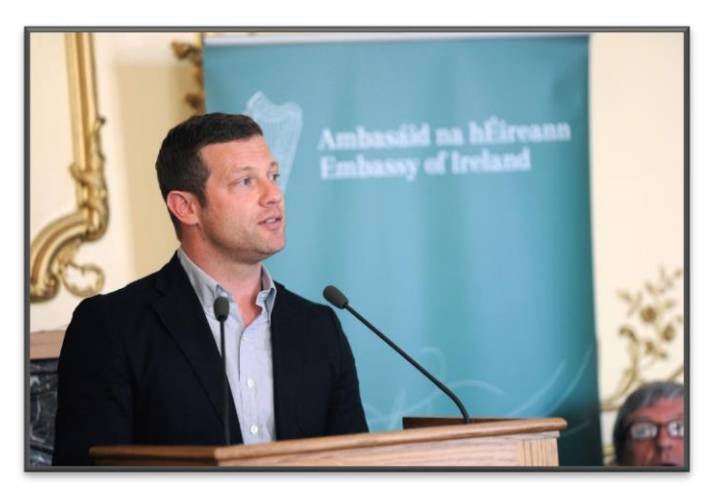
YEATS - BLOOMSDAY BREAKFAST IN LONDON

The Embassy in Warsaw gathered senior publishers and highly respected translators for a moderated discussion on increasing the translation of contemporary and classic Irish literature into Polish over a traditional Bloomsday breakfast. That evening, the Embassy organised a poetry reading event at the Museum of Literature in Warsaw. The Ambassador to Poland read a selection of poems by Yeats in English, with leading Polish literary figure, Antoni Libera. Pieces of O'Carolan's music performed on the harp accompanied the event.