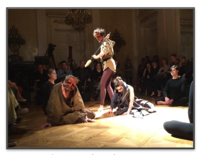
'AT THE HAWK'S WELL' - BUDAPEST

The Hungarian Yeats Society, supported by the Embassy in Budapest , held a two-day conference in the Petőfi Museum of Literature, Budapest. The first day featured scholarly papers on Yeats's work,