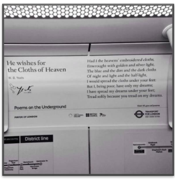
VERSES FROM YEATS POEMS IN LONDON UNDERGROUND.

A major promotion of Irish poetry – including poetry by Yeats – took place on the London Underground from the beginning of March. Posters of verses from two Yeats poems featured there for 8 weeks. The Embassy in London developed a 12-page booklet of Irish poems called