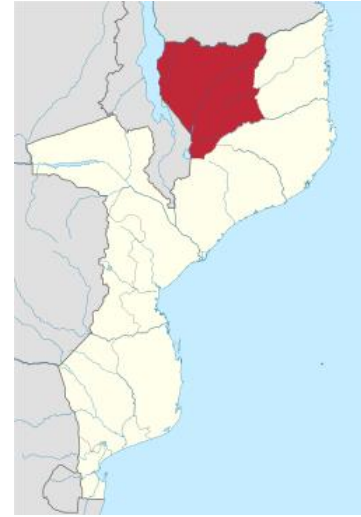
Figure 2 Niassa Province

Situated in the north, Niassa with a land area of 122,827 km 2 and a population of 1,027,037 is the largest and most sparsely populated province in Mozambique. The province has an abundance of natural resources, including unexploited mineral wealth with gold deposits and coal deposits close to Lake Niassa. The Niassa National Reserve, comprising 42,000 km 2 is one of the three largest protected areas in Africa with a large concentration of game, including elephants and lion. The Lichinga plateau has fertile soils, high rainfall and ideal temperatures, providing optimal growing conditions for plantation forestry and agriculture. However, farming is principally of a subsistence nature, although cotton and tobacco are grown commercially and there is growing private sector engagement in forestry. Despite good farming conditions, poor agricultural yields in the subsistence sector and a lack of knowledge about diet and nutrition, mean food security problems and malnutrition are particularly acute in Niassa. Malnutrition rates of 46.8% are recorded particularly amongst pregnant and lactating women. Furthermore, the province has historically registered very low rates of participation by girls in school.