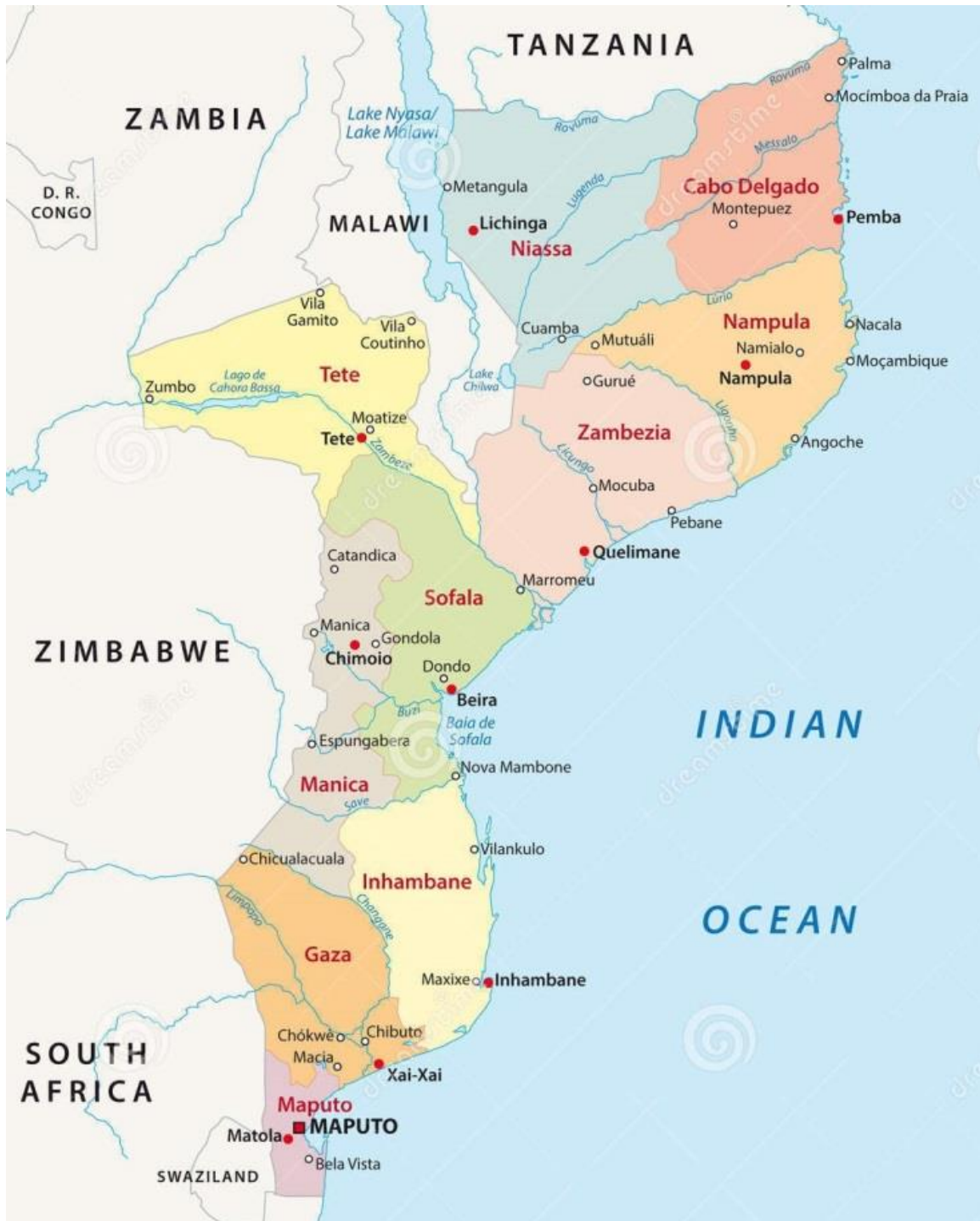
Figure 1: Map of Mozambique