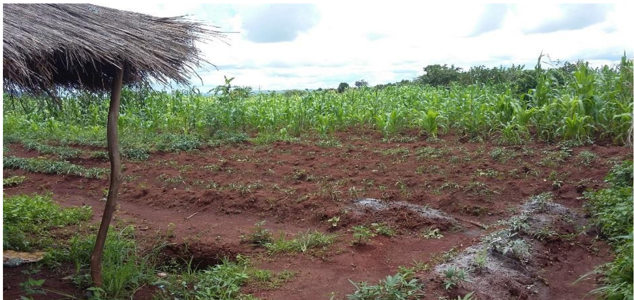
Figure 5 OFSP Crops in Niassa

Partnerships with the Provincial Directorates of Public Works have bolstered the resilience of poor communities through improving access to water with an emphasis on improving climate resilience and through the establishment and training of community committees for water management, and the training of local mechanics to undertake basic maintenance and repairs. Partnership with the National Institute for Disaster Management (INGC) has resulted in the elaboration of an action plan for the prevention and mitigation of natural disasters and its roll-out at local level through the creation, training and equipping of Local Committees for Disaster Risk Management. However, so far this has only been rolled out in one district.