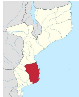
Figure 3 Inhambane Province

Inhambane in the south of Mozambique has a land area of 68,615 km 2 and a population of 1,412,349. However, over 70% of the population lives within 30km of the coast leaving the interior districts sparsely populated and economically marginal. The province has substantial development potential with the exploitation of natural gas by the South African energy giant SASOL, and through the production of citrus fruits, cashew nuts, fishing, and seafood. With 600km of coastline, beautiful beaches and offshore islands, Inhambane has obvious tourism potential and this sector is growing. Nevertheless, agriculture is the core of Inhambane's small economy and over 80% of its population live in the countryside and survive on subsistence agriculture and artisanal fishing. Low rainfall, particularly in the interior means that agricultural production is low and the province cannot produce enough to feed its population. Moreover, Inhambane is particularly susceptible to climatic events that often lead to humanitarian crises. The province suffered from a prolonged drought for much of 2015 and 2016, and the coastal area is regularly hit by tropical storms and cyclones resulting in serious damage to infrastructure, livelihoods and population displacement.